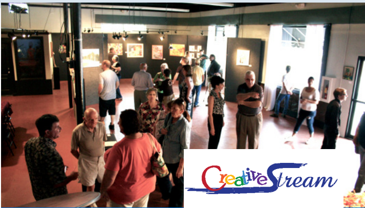
Creative Stream 'Art of Hope' Art Show