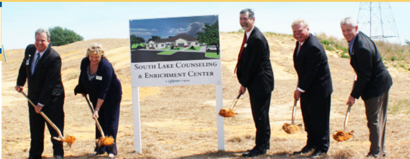
Groundbreaking on our new South Lake Counseling & Enrichment Center

Mission Statement: Supporting Recovery, Promoting Health and Creating Hope