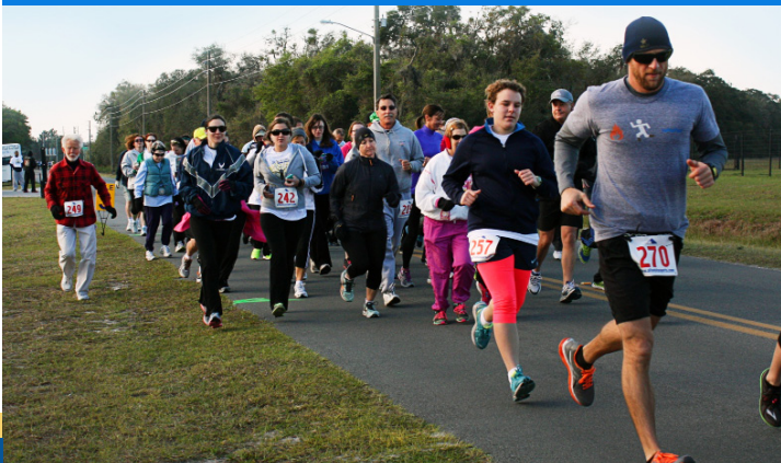
Inaugural Healthy Mind & Body 5K